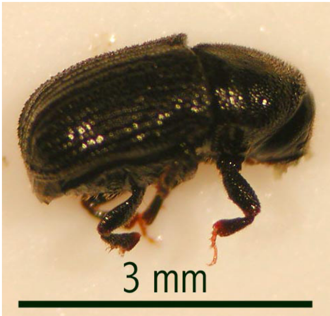
Figure 1. Close-up of a cypress bark beetle

Cypress bark beetles ( Phloeosinus cristatus (LeConte)) are native insects that occur throughout Arizona. They are common in the Verde Valley, Prescott, Payson, and Kingman areas. Under natural conditions, most bark beetles act as natural thinning agents that remove dying, overcrowded, and unhealthy trees. Cypress bark beetles seldom cause mortality in healthy, vigorous trees. However, when host trees are drought stressed, bark beetle populations increase allowing the beetles to colonize seemingly healthy trees.